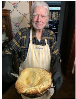
Pfannkuchen, just out of the oven.