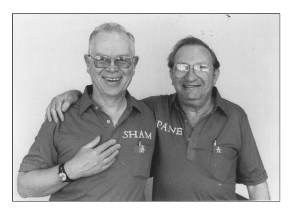
Reprinted from Gator Growl #100, June 2001