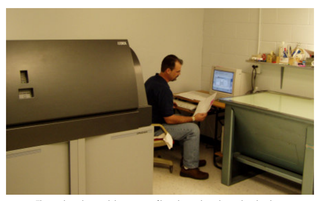
This is where they send the computer file to the machine that makes the plate.