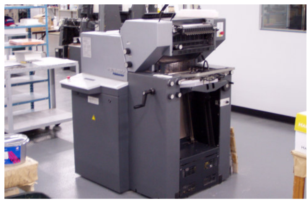
This is the 12x18 Heidleberg Offset that printed the NA

It is also a very clean operation. The pressman has very clean hands. They touch ink very little and when they do they wear rubber gloves.