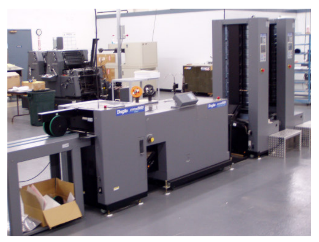
This machine collates, folds, stitches, and trims the NA